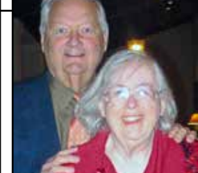
Water To Wine