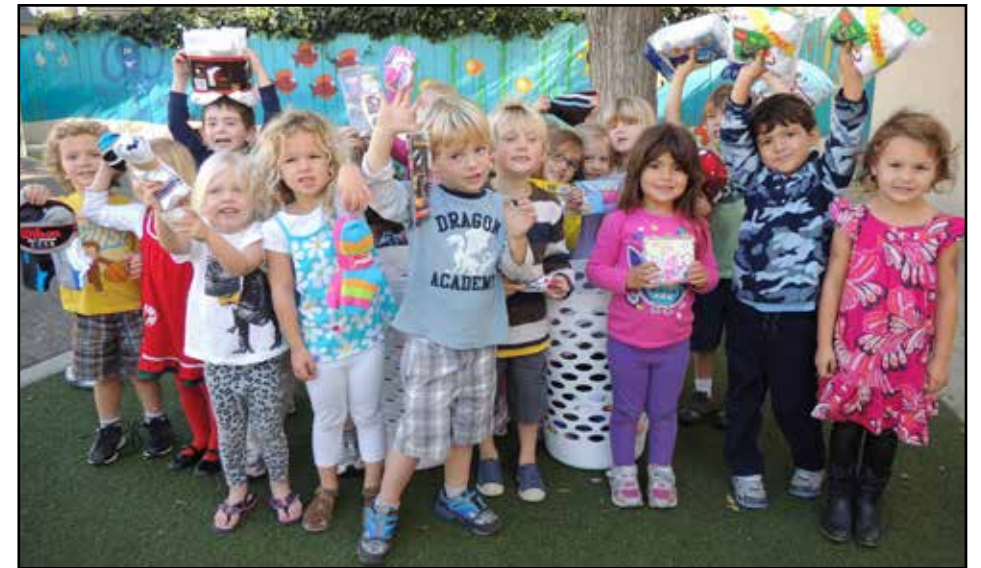
St. Andrew's by-the-Sea preschoolers show off their gifts.