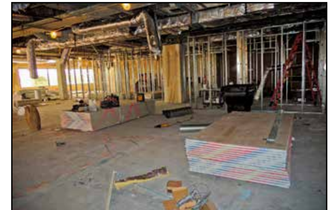
Above: The building that will house our new headquarters in National City. On the right: Our new office in late June.

ECS' new office space is being built out this summer to better serve the agency's needs. Our headquarters will be much closer to our 22 Head Start programs in South Bay, Para Las Familias, and ECS Nutrition Services, and not too far from Friend to Friend and our Safe Havens. We plan to move into our new space in September. We hope you will plan to attend our Open House early next year.