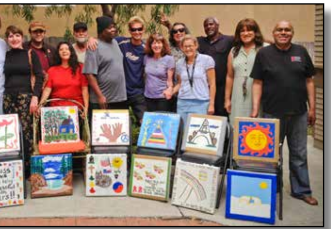
Downtown Safe Haven residents told their stories through hand-painted pavers.

"Thank you for helping me. Everyone who I came in contact with was nothing short of amazing." -- An ACCORD client