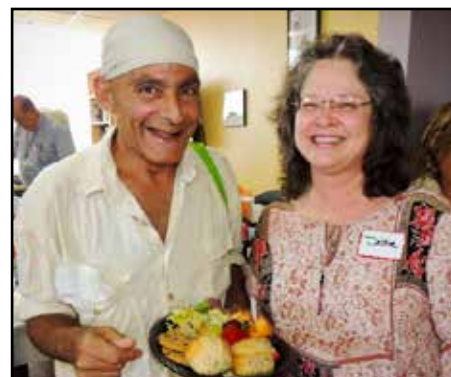
Above and below: Friend to Friend members and supporters enjoy a Life Celebration party.